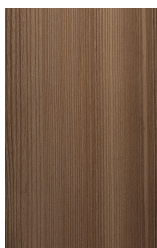
Frassino color tabacco