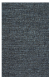
STELVIO - 210 - LUSO