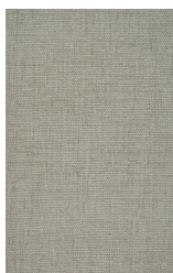
STELVIO - 225 - LUSO

With the Dao Soft sofa, designer Gordon Guillaumier proposes a modular system that focuses on planning freedom and the geometric harmony of soft, calibrated volumes. Designed to create environments devoted to well-being and calm, the Dao Soft sofa stands out for its ability to adapt to formal or informal settings, thanks to balanced proportions and a discreet but recognizable aesthetic. High backrests and seats with differentiated polyurethane padding and Cloud Foam and Microflock inserts ensure great comfort, meeting the needs of the project in both residential and contract settings. Available in two variants - Dao Soft Base, with an upholstered base, and Dao Soft Light, with black feet - the collection is completed with a strong sartorial connotation, expressed in the sewing "a pizzicotto" that features the cover either in fabric or leather with a precise, textural hallmark. In the proposed versions, the Dao Soft sofa is explored through different spatial solutions, to offer concrete tools in defining welcoming, flexible environments consistent with a measured and contemporary design language.